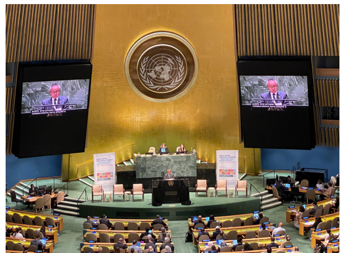
Opening of the High Level Political Forum

We are committed to being part of this global effort, amplifying voices, driving positive change, and fostering collaboration to build a more equitable and sustainable world.