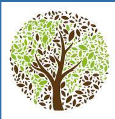
Prepare for Season of Creation 2023: Let Justice and Peace Flow