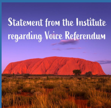
It's time for First Nations Voices to be heard