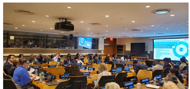
ATD Fourth World's HLPF workshop "Paradigm shift: tools to ensure best practice when engaging marginalized communities and youth"