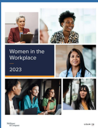
McKinsey & Company: Women in the Workplace 2023 Report