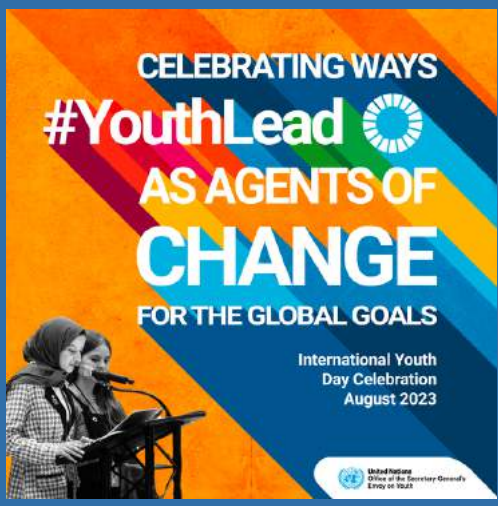
International Youth Day Campaign