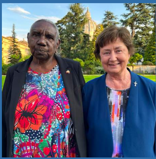
Caring for Our Common Home