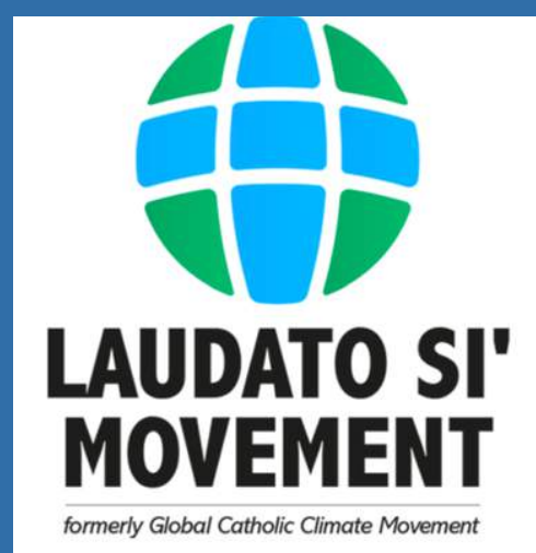
What is the Season of Creation?