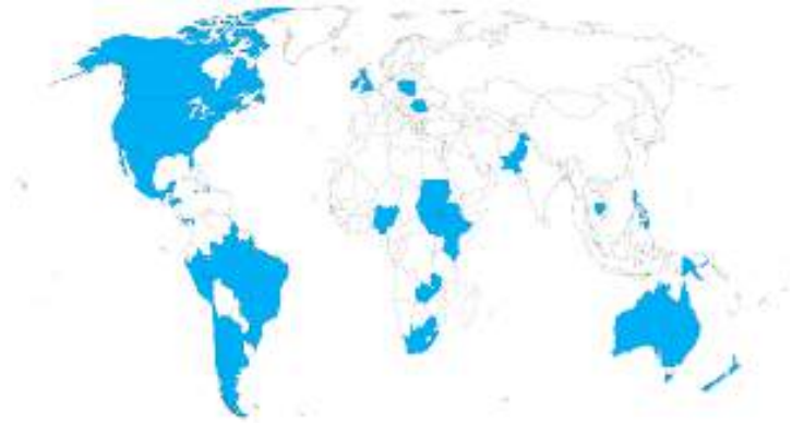
Some areas where Mercy has been involved in

As members of Mercy Global Action, we stand united in our shared commitment to social justice, sustainable living, and care for the Earth. The recent release of Voluntary National Reviews (VNRs) for countries in the Mercy world has provided an enlightening overview of progress towards the Sustainable Development Goals (SDGs). We will examine some of the key messages, with a focus on SDGs 5 (Gender Equality), 6 (Clean Water and Sanitation), and 11 (Sustainable Cities and Communities).